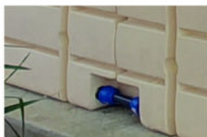
2 tanks connected with tank to tank connection kit

IMPORTANT: Thread tape should be used on all couplings and ball valves.