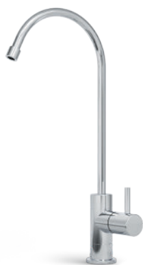
High Loop Designer Faucet DFU180