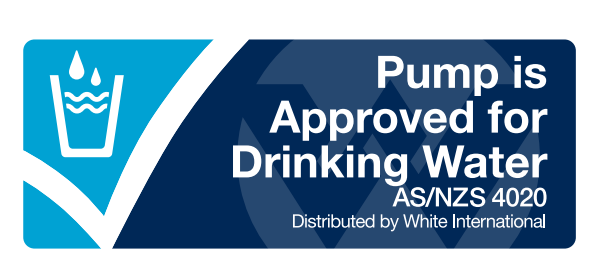
12 Month Warranty

WHI-SK I OPPHS2 Auto Restart Control combines the latest technology in pump protection with the reliability of an electro mechanical control system. Through electronic design the control prevents contant pump cycling through constant pressure and flow detection. Further incorporating integrated compact design features that support user friendly installation with the provision of a plug and play electrical configuration and inbuilt pressure gauge for up stream leakage diagnosis.