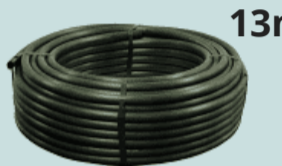
13mm Poly Pipe