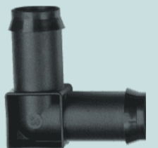
Barbe Poly Elbow