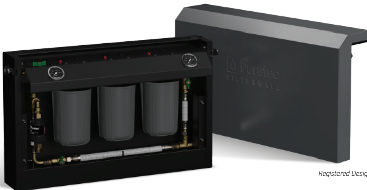
3-Stage Filtration System with bypass and PVM