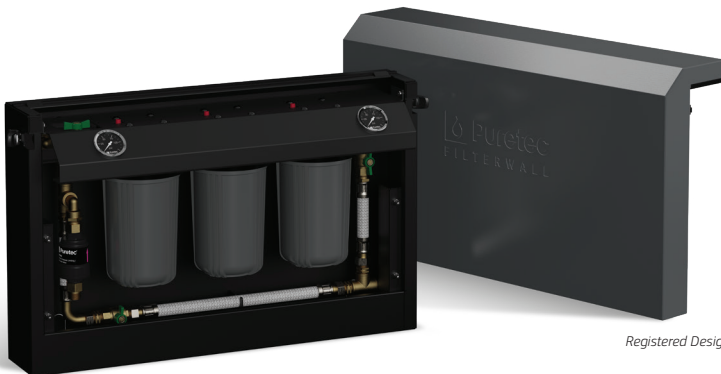
3-Stage Filtration System with bypass and PVM