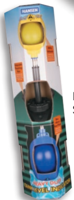
Packaged Store Box

NZ patent 596360 & registered design 415007 Australian patent 2012203010 & registered design 340061. Copyright 2011 Hansen Products NZ Ltd.