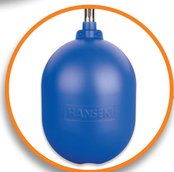
LONG BOTTOM FLOAT 155 x 230mm long bottom float ensures excellent buoyancy for accurate indication of fluid level