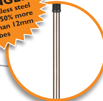
HEAVY DUTY STAINLESS STEEL TUBE 16mm Stainless Steel Tube for long life durability. Versatility of 3 Tubes allows for a tank fluid level reading of up to 2 metres (additional Tubes available for taller tanks).

50% STRONGER 16mm stainless steel tube offers 50% more strength than 12mm tubes