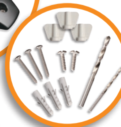
PLASTIC & CONCRETE TANK MOUNTING KITS Accessories supplied for mounting to both plastic and concrete tanks including screws, plugs, wing nuts and drill bits

50% STRONGER 16mm stainless steel tube offers 50% more strength than 12mm tubes