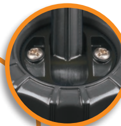
SECURITY LOCK SCREWS Screws lock the tubes into a vertical position preventing jamming in any weather conditions