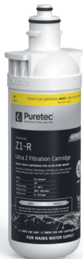
Z1-R replacement cartridge