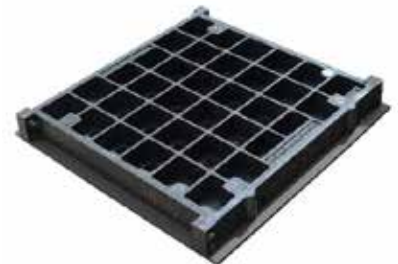
Class B Concrete Infill [6x6CIB] Class D Concrete Infill [6x6CID]