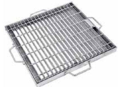
Class B Grated [6x6GB] Class D Grated [6x6GD]